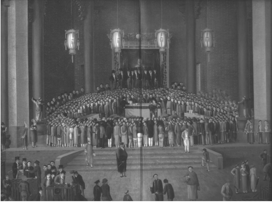
Fig. 3. The Trial of Pirates in the Consou House, Canton, 1827. (Current location unknown).