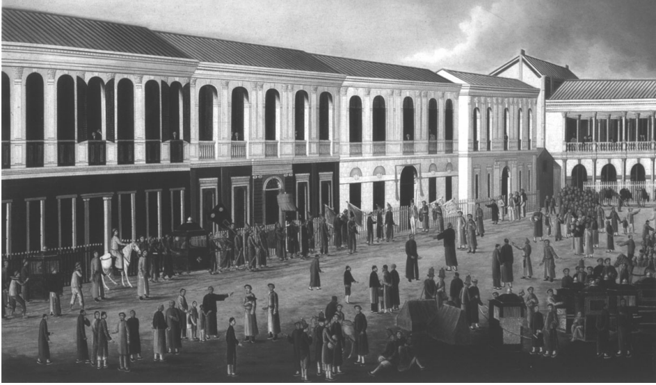
Fig. 1. View of the front of the Hongs at Canton, with the British Hong in the background, after 1807. Courtesy of the Winterthur Museum & Country Estate, Winterthur, DE (Catalogue No. 65.1601).

with defending the Chinese verdict. Remarking that it was an unprecedented case, he argued that it “cannot justly be made the ground-work of any inference”. He also explained that the flagrant corruption was mitigated on the grounds of its affair’s notoriety, and because it involved national pride and an inflamed xenophobic public. Most importantly, he portrayed the outcome as an olive branch extended by the Qing, and as a judicious solution to an intractable dispute: “it neither produced, nor was intended to produce, the slightest deviation from substantial justice in respect to the person accused”. He concluded by declaring that because the concerted verdict was so plausible (!) the Emperor’s acquiescence “certainly cannot be fairly considered as any impeachment of the judgement and impartiality of his government”. 55